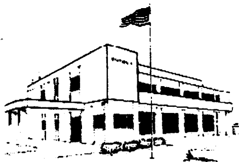
STATION NO. 1 16152 W. 143rd St.