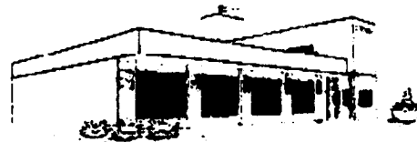
STATION NO. 2 13010 W. 143rd St.